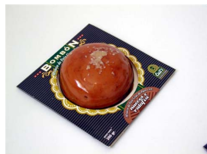
311214 NUTS AND "RATAFIA"