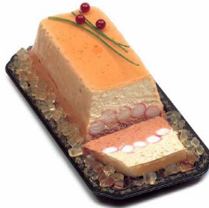
311101 Mediterranean fish