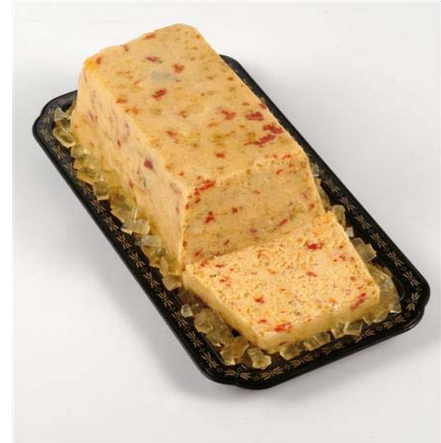
NEW- 311103 Cod fish and red Piquillo"pepper