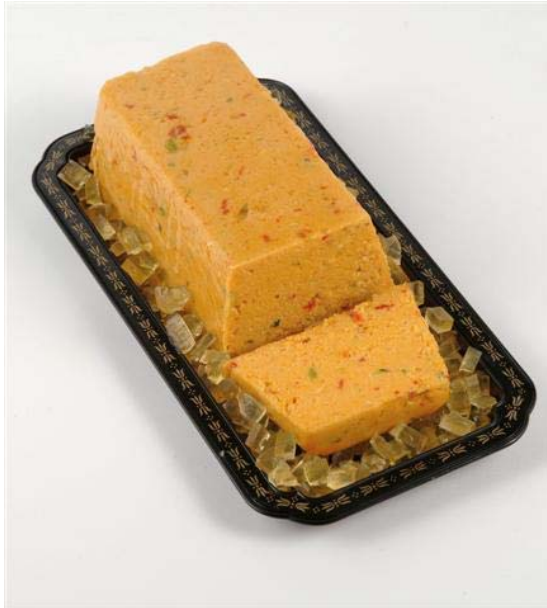
NEW- 311105 Grilled vegetables