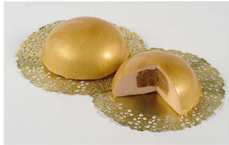
NEW - 311211 Gold Bombon Mousse of Duck Foie Gras with Figs