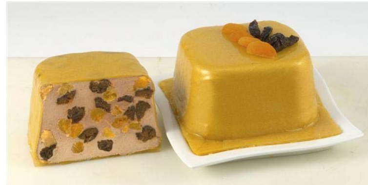
310521 with plums & dried apricots