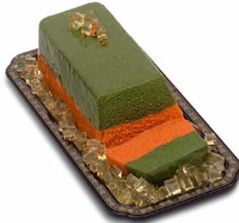
311104 Spinach and piquillo's red pepper