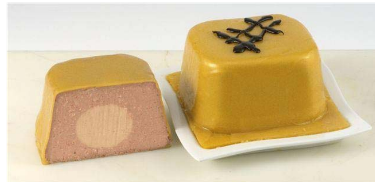
310522 with Foie Gras Medaillon